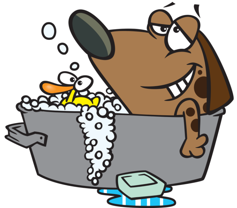
It's time for a bubble bath.