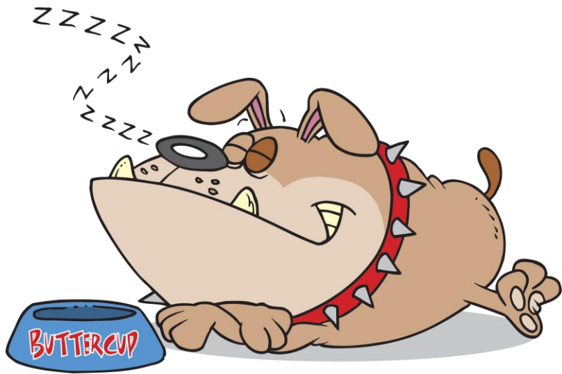
It's time for lunch and a nap.