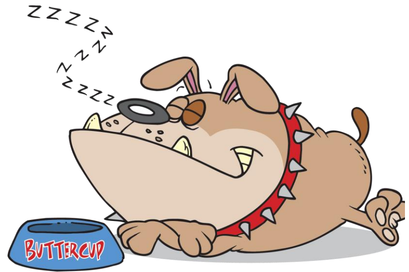
It's time for lunch and a nap.